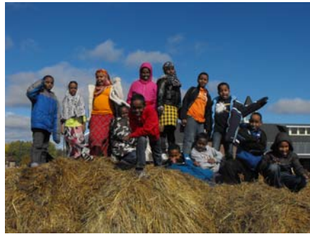
Elementary Field Trip to Emma Krumbrees