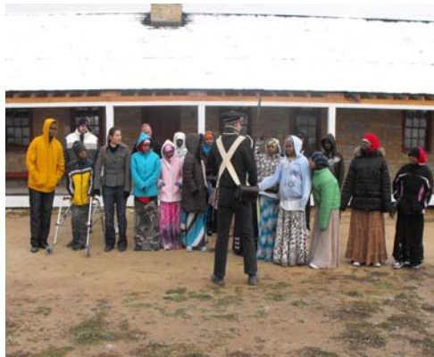
Middle School at Fort Snelling